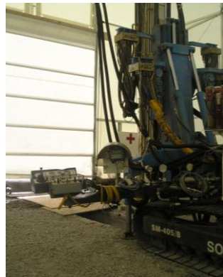
WINTER WORK IN TENT