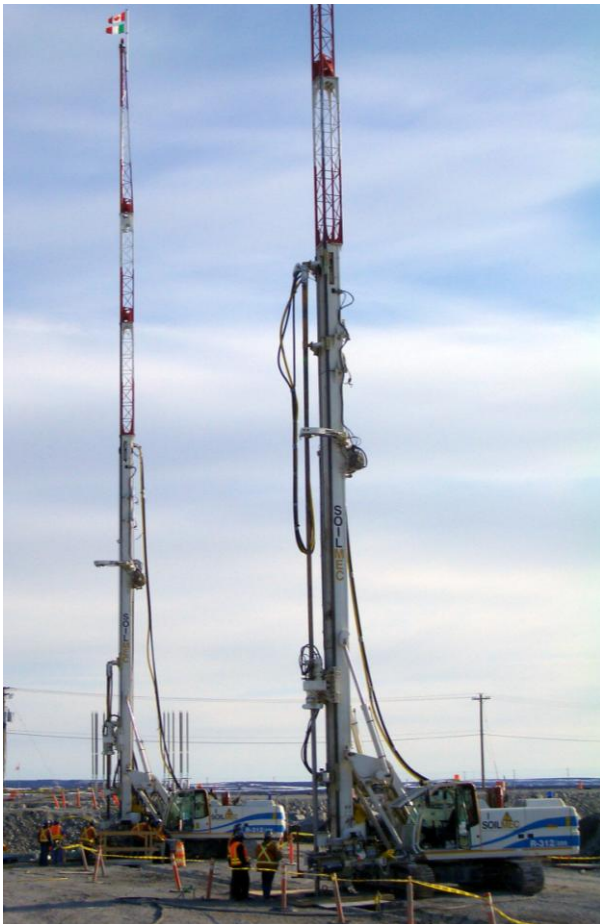
JET GROUTING OPERATIONS

The Jet Grouting contract value was $14 million Canadian Dollars and the work consisted in the installation of a single line cutoff wall for a total of 1,169 columns with depth exceeding 135 ft. Prior to carrying out any work, a series of tests were conducted to determine the characteristics and parameters to be used for jetting. The first phase of the work was performed during the winter months with temperatures reaching the -50 degrees Celsius (-58 Fahrenheit). Work was conducted inside heated domes for both the drilling and mixing operations. The second phase of the work was carried out during the summer months, after the installation of the plastic concrete diaphragm wall and grout curtain by others. The work was completed on schedule in approximately 7 months. The equipment used, manufactured by SOILMEC, was customized for use in the demanding conditions imposed by the site.