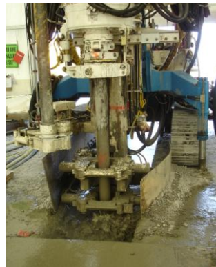
JET GROUTING DETAIL